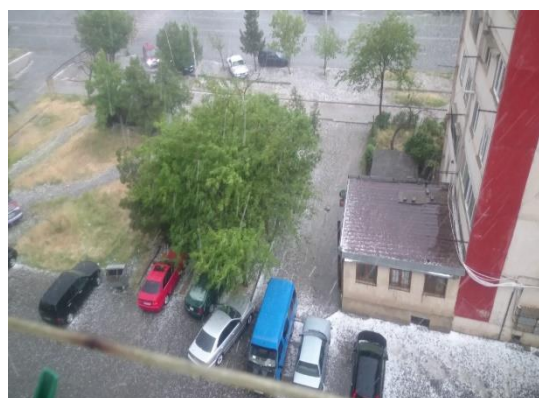
Fig. 4. Hail in Rustavi on 10 June 2017

http://pimg.mycdn.me/getImage?disableStub=true&type=VIDEO_S_720&url=http%3A%2F%2Fvdp.mycdn.me%2FgetImage%3Fid%3D283836155197%26idx%3D30%26thumbType%3D47%26f%3D1%26i%3D1&signatureToken=ufmUSs5OxaX2MJAjRzMggA – Left https://i.ytimg.com/vi/xGS648MXzWw/maxresdefault.jpg - Right