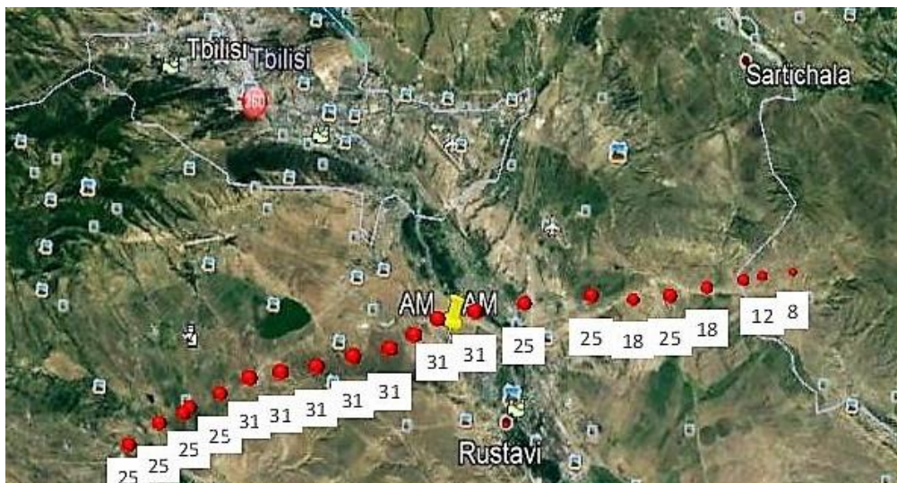
Fig. 3. Trajectory of the movement of the center of the hail cell on 10 June 2017 from 18 hours 12 min through 19 hours 13 min (numbers below - the maximum sizes of hail stones in mm, AM - Rustavi Auto Market)