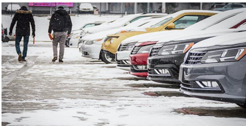
Fig. 5. Hail at the Rustavi Auto Market 2017 June 10. More than 5000 automobiles are damaged. https://sputnik-georgia.ru/video/20170202/234741271/rustavskiy-avtorinok-autopapa-v-poiskah-mashini-mechti.html