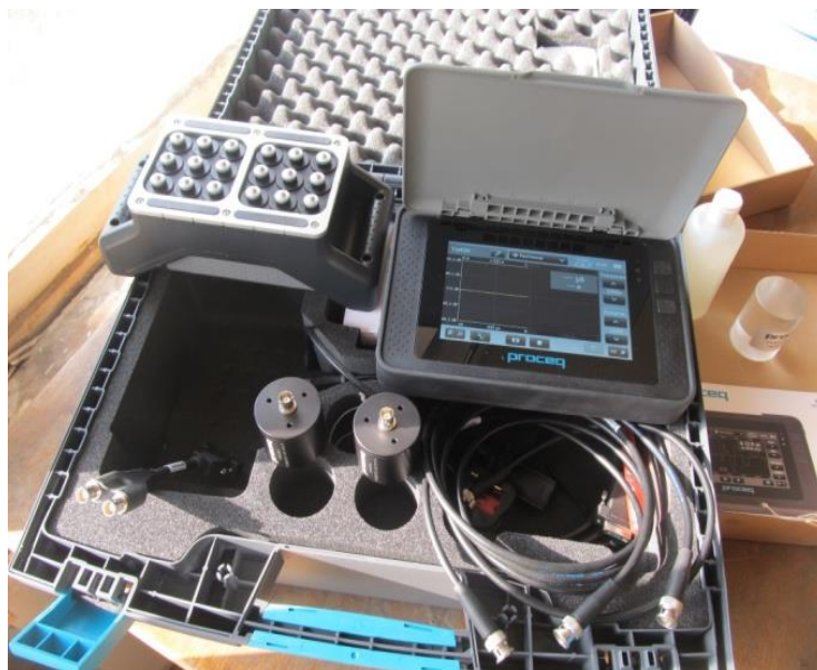
Fig.2. PUNDIT PL-200 and PL-200PE Ultrasonic flaw detector

We used ultrasonic equipment from the Swiss company (PROCEQ, https://www.proceq.com/ ) to perform geophysical work, which is called Pundit PL-200 and Pundit PL-200PE.