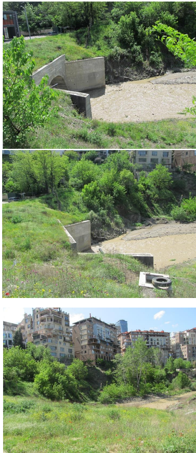
Fig.3. The entrance of the tunnel 2.

[Shergilashvil, 2016]. After the disaster the river-bed was restored in its original form. Only little corrections were made, namely, walls were built before the two tunnels for guiding the water flow. The inlets of these tunnels are located at the points of maximum bending of the open section of the artificial river-bed (Fig. 3. Tunnel 2). The open section of the \approx 30 m long artificial river-bed before Tunnel 2 (Fig.3) bends to that extent that the tunnel is practically located perpendicularly to the river flow. Therefore, supposedly, in the case of increase in the water level the area between the guiding walls will become the problem area of the closed river-bed (water stagnation zone). In this case the effect of the guiding walls can be transformed in hydrodynamic funnel effect and it will additionally reduce the water flow rate in the tunnel.