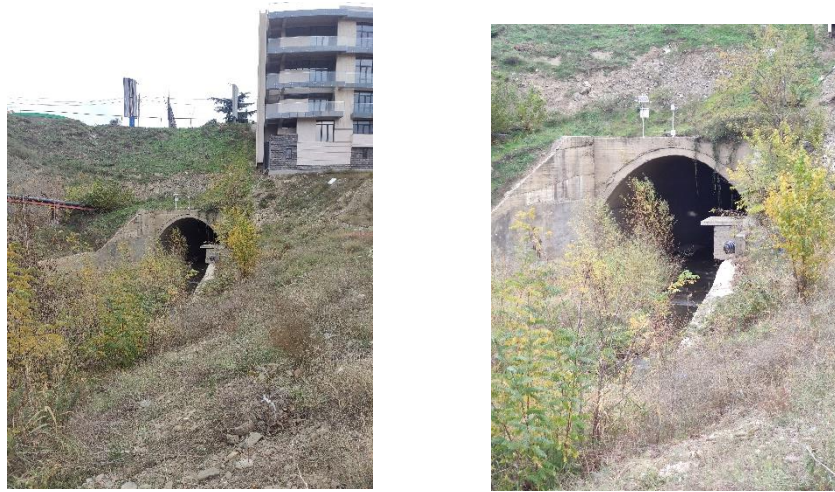
Fig.1. The entrance of the tunnel from Svanidze Street